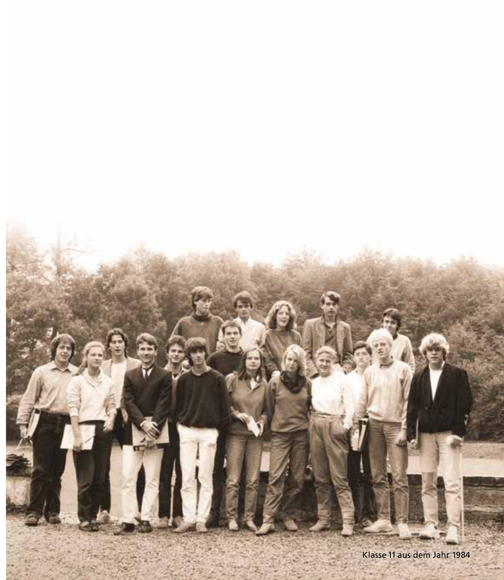
Klasse 11 aus dem Jahr 1984